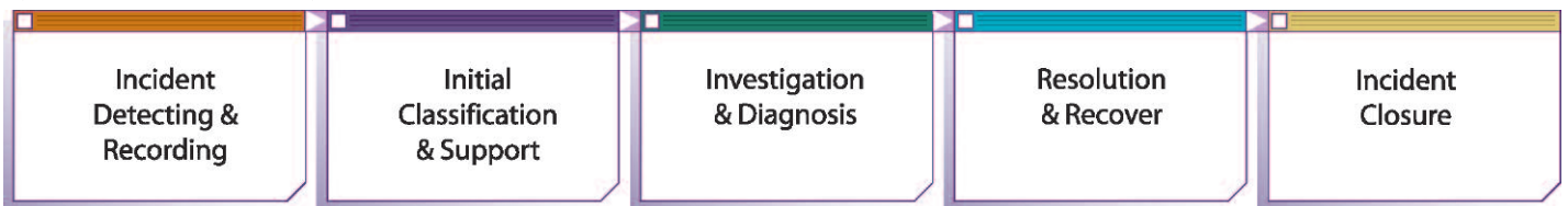
Typical Incident Management Lifecycle

For example, assyst can interface with network and systems management software by automatically accepting incidents triggered by such systems. By bridging the gap between business and technical management of networked IT systems, assyst offers an unprecedented level of cohesiveness. As a result, Service Desk staff can proactively manage network and system events, and pre-empt problems before they result in service degradation.